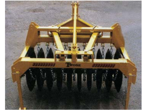
Front mounted press